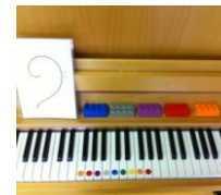
Music is colourful!

You can now let your children play with the "Living Notes". You can also try to attach each tone to its colour - even from an early age, children can distinguish between high and low notes. However, be patient, the playful feeling of the games must be maintained.